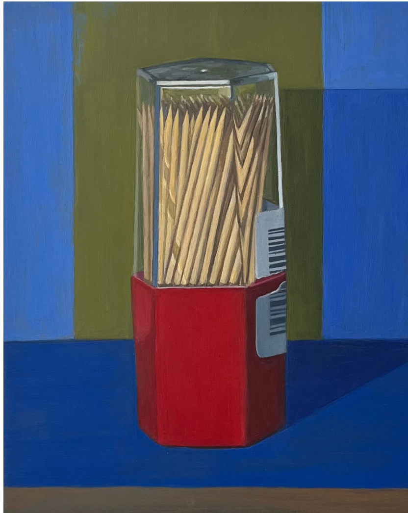
Toothpicks by Reed Wilson

Layers at Town House Spitalfields, 5 Fournier St London E1 6QE. 16 th – 24 th September